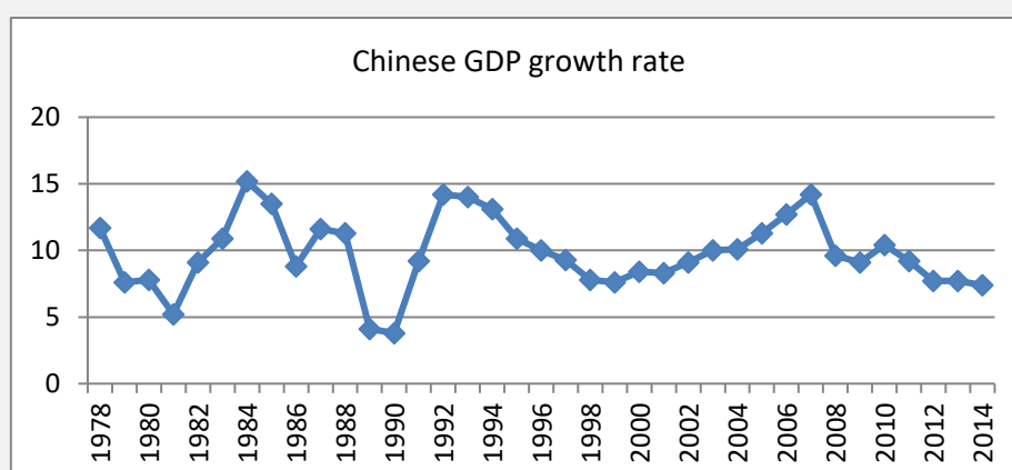
Figure 1: Chinese GDP growth rate for the past 1978-2014 years with the average growth rate 9.8% per year. There is an obvious slow down after 2008.

In order to be successfully complete its run for the modernized economy, China must be able to maintain a high growth rate [Figure.1]. The reasons are: 1) To release the potential of the biggest human resources of the world, China needs to maintain a high level employment rate which needs Chinese economy to grow a high speed around 7% at least. 2) The world is changing very fast, in order to grasp the best opportunities since world II, China has to move fast before the world shifts its conditions. 3) To compete for the world resource utilization, Chinese economy must be attractive to the foreign investors and international resources, and the key is to keep Chinese economy as fast as it can be for the best return of the foreign investments. 4) There are other big economies which are developing fast which will put a pressure on Chinese economy to hold on a high speed growth rate in order to be a winner instead of a loser of the century. The following are the objective approaches for this strategies.