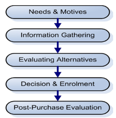
Figure 2.2: Student Choice Model (Adapted from Al-Fattal, 2010)

The process that students go through in choosing an institution is a complex series of activities (Litten, 1982). According to Al-Fattal (2010), five stages are identified as being the stages that students go through in their choice process. The five stages are needs and motives, information gathering, evaluating alternatives, decision and post-choice evaluation. In his view, a need or motive for higher education arises on the part of the student. The student then seeks Information on the various providers of the type of education he or she may want to acquire. The various alternatives are evaluated using the criteria best suitable to the student after which a decision to enrol is taken. After enrolment an evaluation is done as to whether the decision to enrol is worth it or otherwise. Figure 2.2 below shows the student choice and enrolment steps.