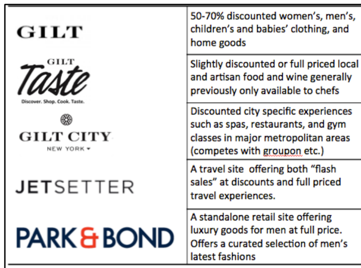
Figure 3: Presented by using logos from Gilt's sites