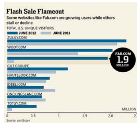
Figure 2: Wall Street Journal

partnered with American Express, hoping to leverage the latter's 42 million customers for an early influx of American Express card holders. 7