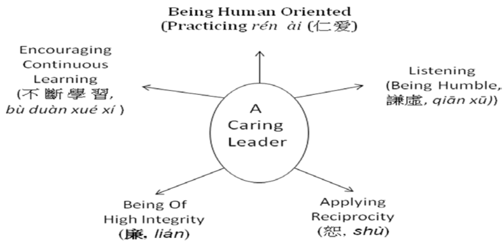
Figure-2 Core Values Of A Caring Leader

Figure 2 shows the core values of a caring leader, the Confucian perspective.